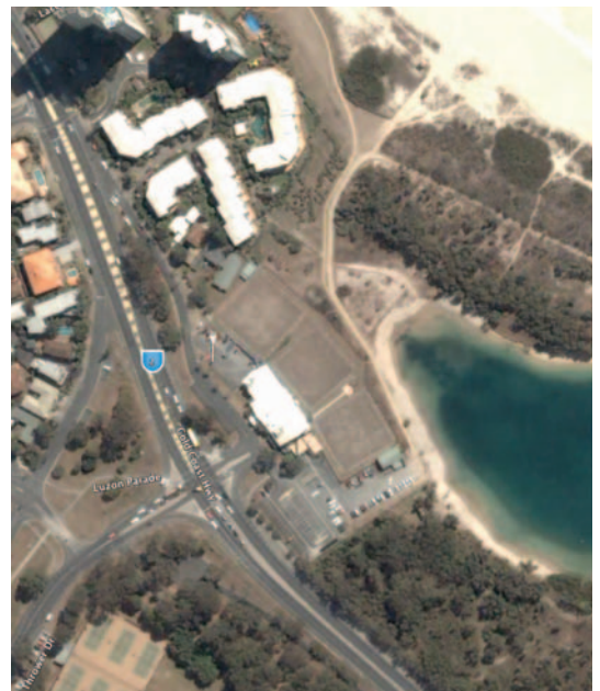
Waterfront development opportunities may provide significant benefits, but also significant challenges