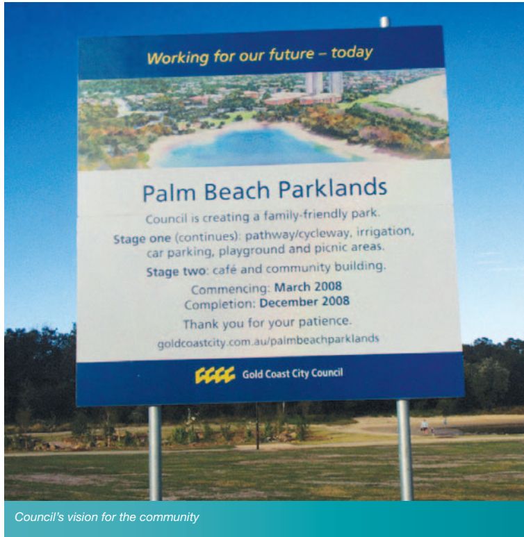
Council's vision for the community