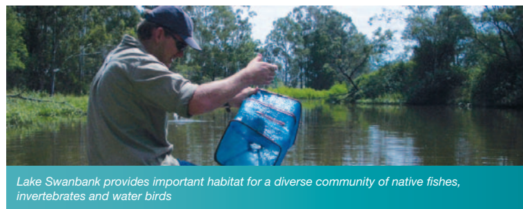
Lake Swanbank provides important habitat for a diverse community of native fishes, invertebrates and water birds

A holistic approach is often essential to gaining the depth of understanding necessary for confident action - frc environmental's team of experts understand the value of teamwork and the synergies that result