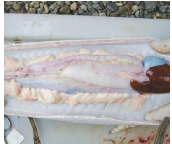
frc environmental’s specialist ecologists know fish from the inside out

“With an experienced fish pathology group, frc environmental realised that time was of the essence and promptly arranged a site inspection...”