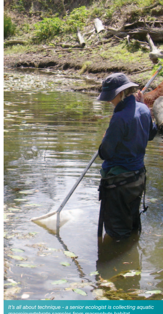
acroinvertebrate samples from macrophyte habitat

"... the proposed dam and pipeline's potential impacts were reliably assessed and mitigated, aquatic flora and fauna surveys included habitat, water quality, macrophyte, macroinvertebrate and fish assessments."